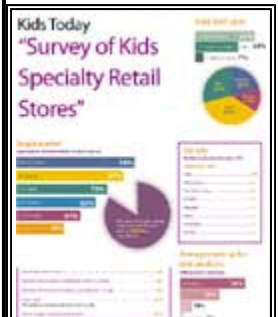
Kids Specialty Stores

kids today Survey of Kids Retail Giants Click here