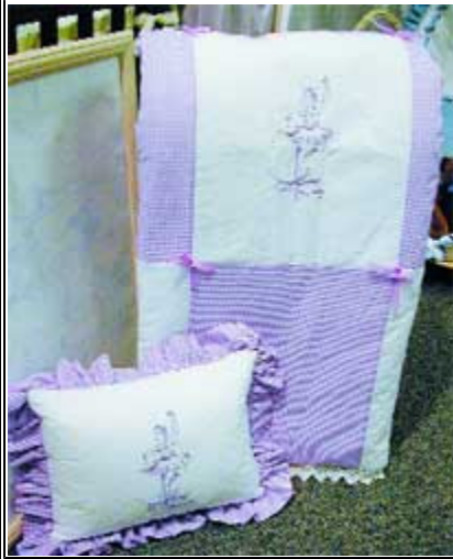
New exhibitor Tickle Toes showed its Lavender Dreams crib set, which coordinates with Seabrook Wallpaper. The four-piece set is around $640 retail.