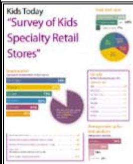
Kids Specialty Stores