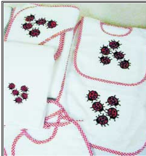
New exhibitor Spoiled Rotten Babies brought its collection of gift packages, including bibs, burp cloths and hooded towels, to the Kids Kollection section of the Atlanta Gift Market. Available in nine different designs, including the ladybug shown here, products retail between $11 and $29.